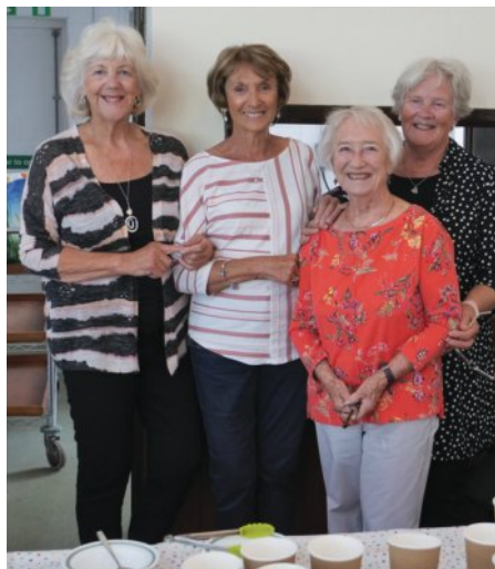
● One of our regular Horizons Coffee and Tea teams!

The pandemic has compounded the problem, and the Phil is now releasing recordings of the concerts to watch at home, which some supporters are choosing to do. I am finding it difficult too, as it is hard to remain enthusiastic with so little support. We do not have a co-leader, and if the group is to