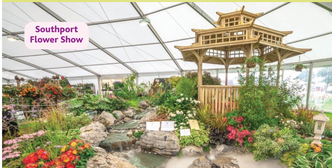
Southport Flower Show